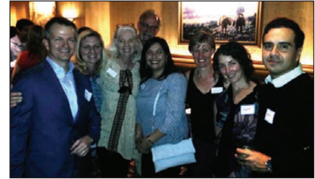
PARENT SOCIAL AT THE DRISKELL

The GREAT NORTHERN FAMILY PICNIC and the picnics and gatherings sponsored by the Parent Association, brought us together to celebrate milestones in the school calendar and to enjoy each other's company.