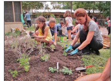
OUTDOOR ENVIRONMENT DAY

The elementary children and families enjoyed an evening sharing poetry with each other at the annual CANDLELIGHT POETRY NIGHT .